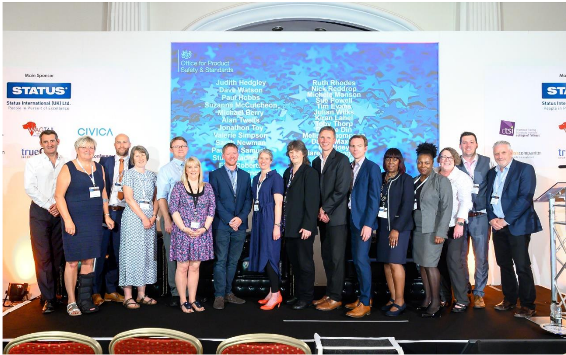
Photo: Winners at the Office of Product Safety & Standards annual Regulatory Excellence Awards in June 2022.

The Environmental Health Team from Horsham District Council were among those individuals, teams, local authorities, and businesses that have made a significant contribution to protecting people and places and supporting business